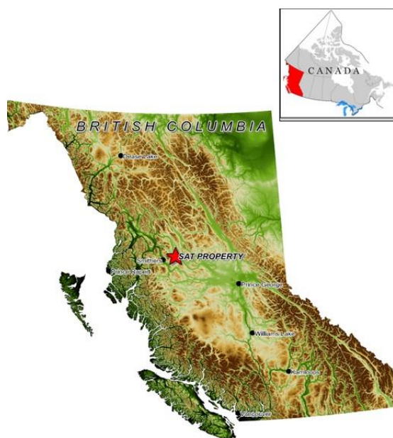
Figure 1. SAT copper property location

“The geological setting, with the historic Bell and Granisle mines lying 12 kms to the northeast and 13kms to the east, respectively, makes the SAT Property an intriguing porphyry copper target in a prolific porphyry belt,” commented Prudent President, Brett Match.