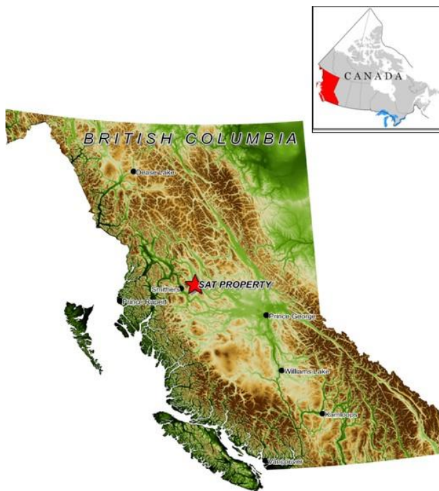
Figure 1. SAT copper property location